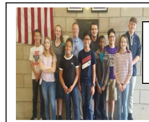
September Students of the Month