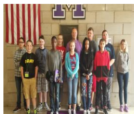
August Students of the Month