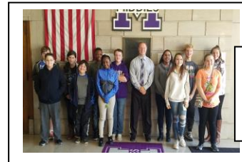
October Students of the Month